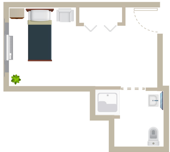
Private Suite #1 192 sq. ft.