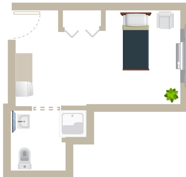
Private Suite + Refreshment Nook #2 182 sq. ft.