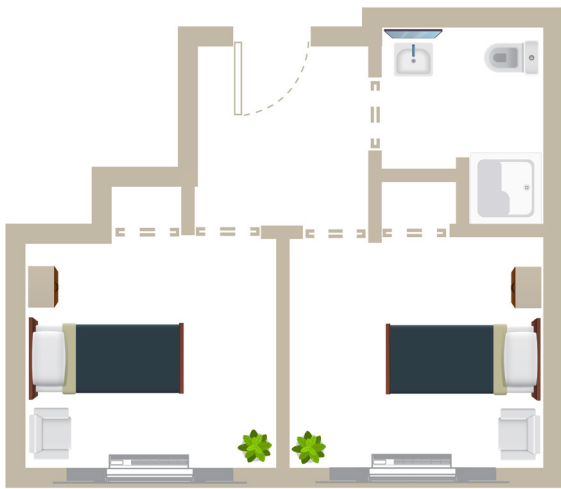
2 Bedroom, Shared Bath 220 sq. ft.

Our community includes companion and private rooms — furnished or unfurnished — as well as an on-site beauty salon and barber shop, private spa and complete dining programs with three meals and snacks daily. All rooms offer cable TV, individual climate control and a private bath with step-in showers.