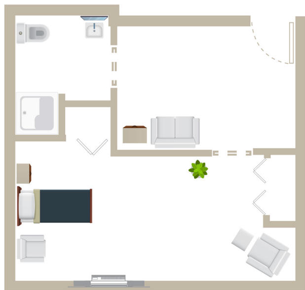
1 Bedroom Deluxe #1 277 sq. ft.