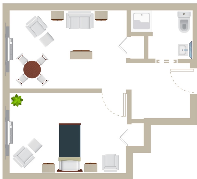
1 Bedroom Deluxe #2 176 sq. ft.